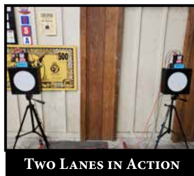
TWO LANES IN ACTION