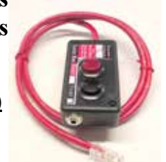
New Model Button Controller with Toner Jack

To Purchased Components Separately (See Page 8)