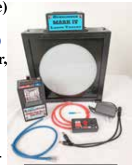
ONE LANE PACKAGE