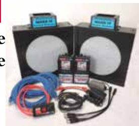
TWO LANE PACKAGE SEE OPTIONS