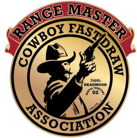
At CFDA Titled Events